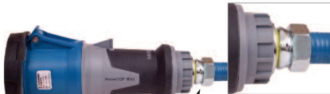
Threaded NPT Entry - No Adapter Required